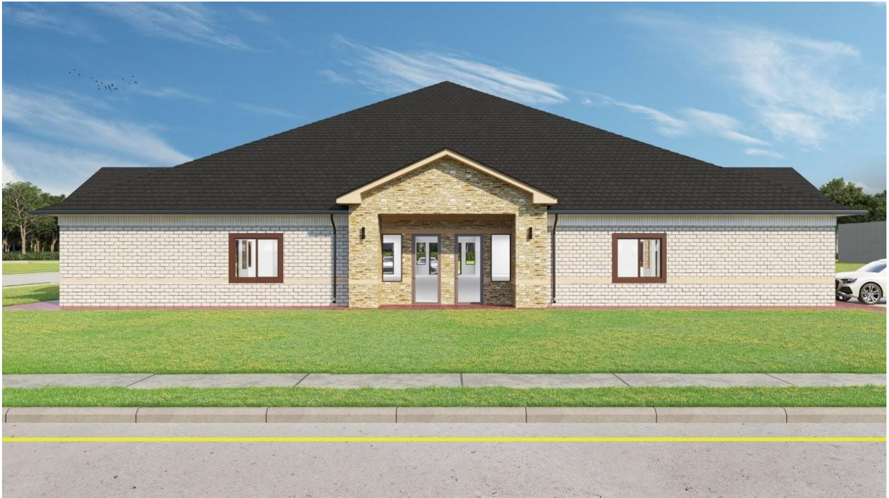
View from Harroun Ave (South)