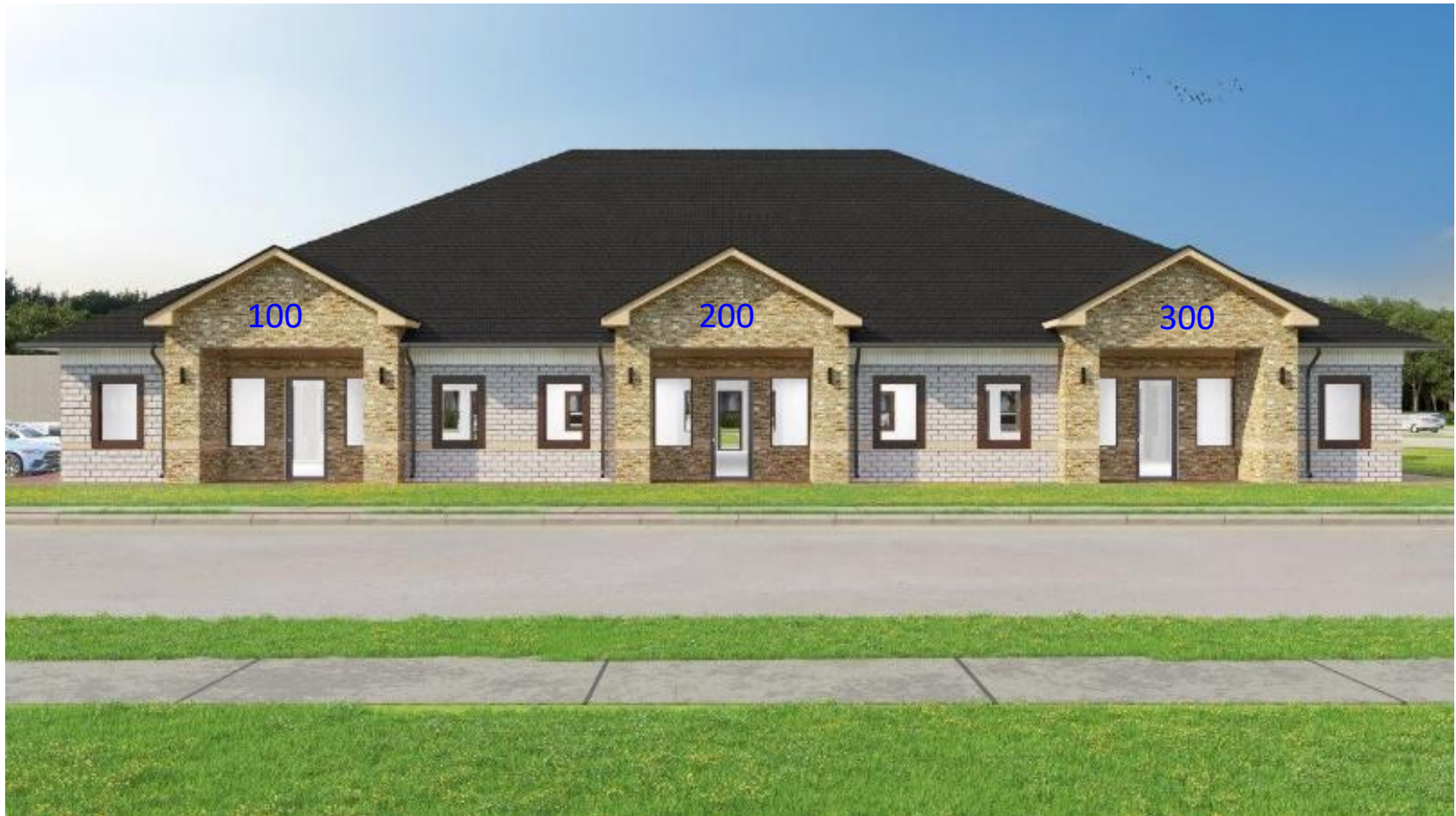
View from Heritage Dr (West)