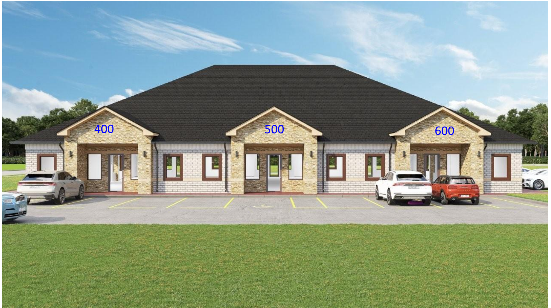
View from East side