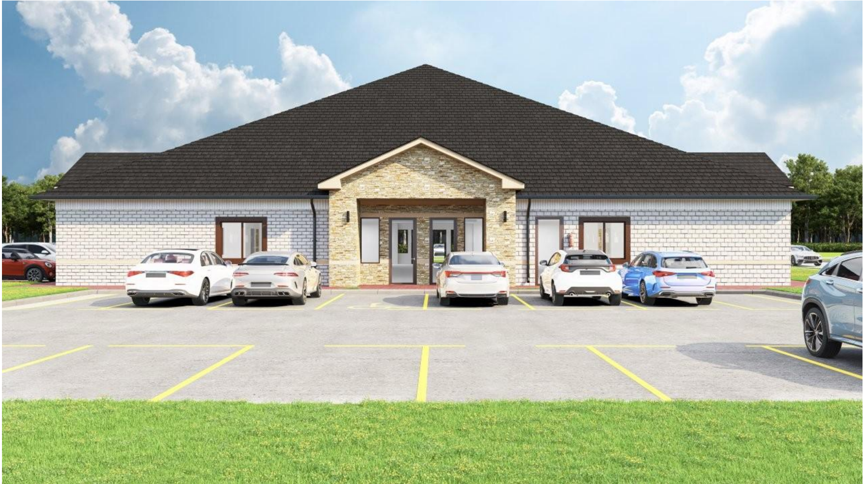
View from North side